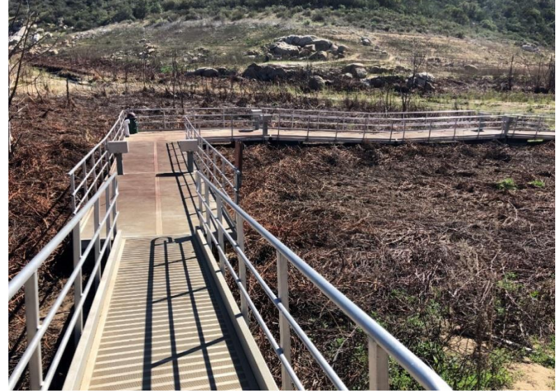
Fishing Platform Sitting on Soil (Pre-Damages) Before January 2023