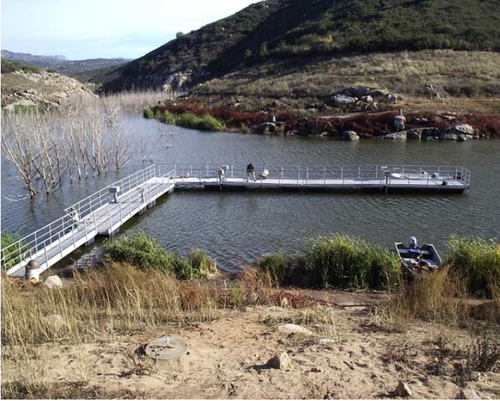
Fishing Platform Floating on Water (Pre-Damages) Before 2019