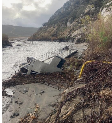
Fishing Platform Post-Damages January 2023