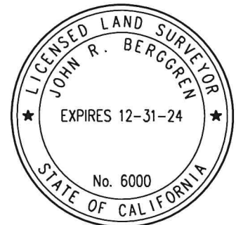
EXHIBIT B - QUITCLAIM PLAT